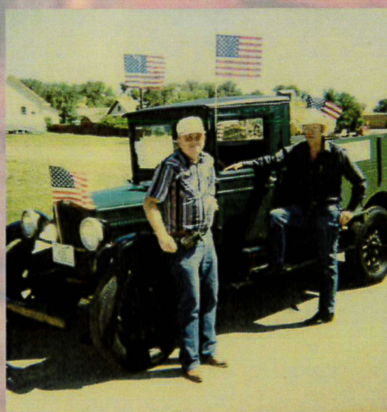
"And That's A Fact"